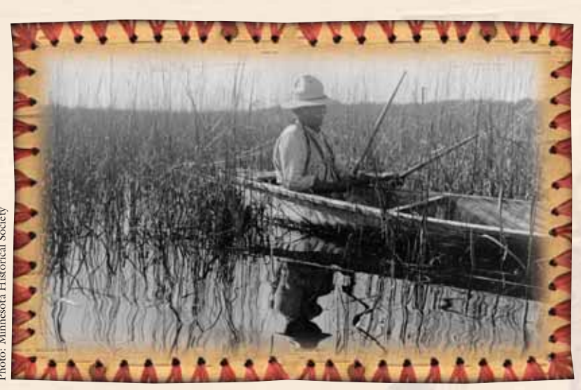
This Ojibwe man is gathering the wild rice found in the shoots that rise above the water.

In 1862, the Mille Lacs Band was instrumental in keeping peace among the Ojibwe and then sent many of its young men to serve in the Civil War. Meanwhile, Band leaders struggled with the shifting