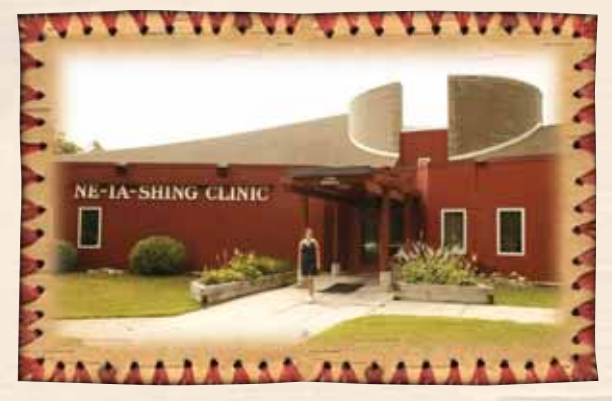
The Ne-Ia-Shing Clinic, which is operated by the Mille Lacs Band, provides general and specialty care, dental and optometry services, and pharmacy services.