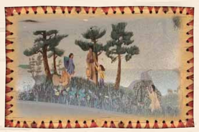
This mural contains 232,000 ceramic tiles and is the creation of more than 1,000 students and visitors to the Nay Ah Shing Upper School.

The school's mosaic mural took five years and 232,000 ceramic tiles to create. It is the largest mosaic mural of its kind in Minnesota. The 10' by 55' artwork, created by 1,000 students and visitors from around the world, depicts Indian life and its relationship to nature and culture. It celebrates the great respect Ojibwe people have for the natural world through images of Mille Lacs Lake, figures of drummers and dancers, and floral and beadwork motifs.