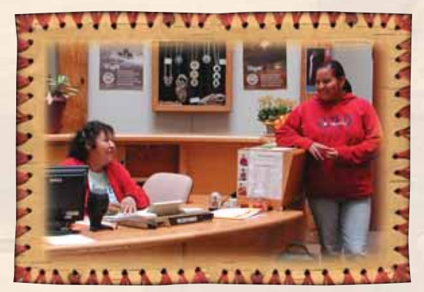
The Mille Lacs Band has nearly 635 full-time employees. They work at the Band's government center, schools, clinics, community centers, and other facilities.

Band leaders are advised by their department commissioners, staffs, and Elder and youth advisory councils. Ojibwe Elders are highly respected for their understanding of how Ojibwe traditions can answer today's most difficult questions, and the youth are encouraged to get involved in their government and culture at a young age.