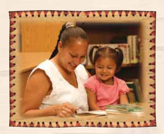
The Mille Lacs Band offers a variety of services and facilities to children and families to promote education and healthy living.

To administer the Band's programs and services, the Chief Executive appoints and the Band Assembly ratifies the following Commissioners for four-year terms: